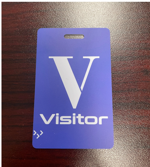
Blue Visitor Badges